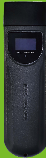
P30 Patrol stick