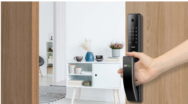
Automatic locking and unlocking after verification