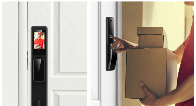
Real-time monitoring from the indoor