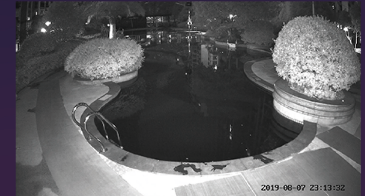
Traditional Black/White Vision

*In extreme environments, such as a completely enclosed warehouse or rural areas in a moonless cloudy night, the C3X will shift to black/white mode to ensure utmost image clarity.