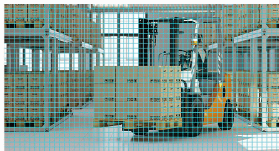
H.264 (Mainstream Video Compression)

Using the latest H.265 video compression technology, the C3X renders clearer and smoother video while reducing the need for data storage space and bandwidth.