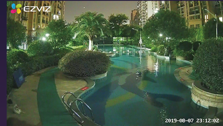
C3X Night Vision*

Leveraging supplemental lights to achieve color night vision was brilliant – until the introduction of the C3X. The C3X uses dual lenses and dual infrared lights to render better color images even in the lowest light conditions. There's no need for spotlights. C3X's colors are more natural, and the image is more evenly-illuminated.