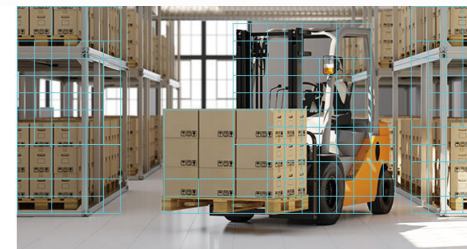
H.265 (Upgraded Video Compression)