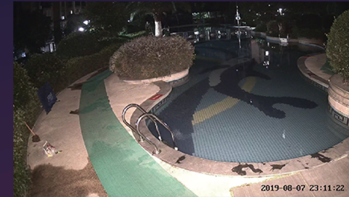
Night Vision with Built-in LEDs